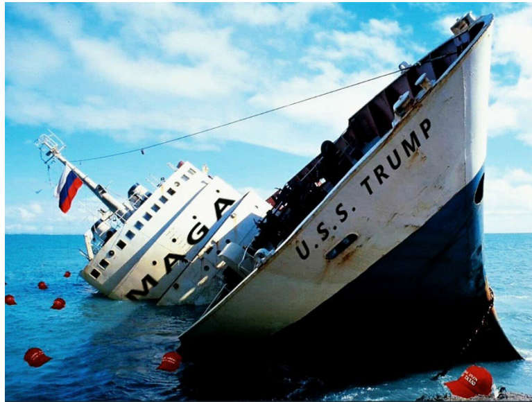
Figure 5. Metaphorical portrayal of Trump as a SINKING SHIP (Yvette with a Y 2018)

This meme depicts a sinking ship named TRUMP with a Russian flag. There are red hats with Trump's catchphrase Make America Great Again floating around the ship. There is the abbreviation U.S.S. standing for United States Ship (MWD, s.a. ) on the side of the ship and also the abbreviation of Trump's catchphrase MAGA on the cockpit. Taken together, these pictorial and verbal perceptual stimuli bring about the TRUMP-PRESIDENT IS A SINKING SHIP multimodal metaphor. The target domain is exclusively represented in the verbal mode ( TRUMP , Make America Great Again , MAGA ), whereas the source is cued visually and verbally ( U.S.S. ). As in the previous examples, the verbal text directs the recipients to the pre-determined meaning of the image.