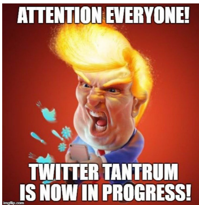
Figure 3. Metaphorical portrayal of Trump as a CHILD THROWING A TANTRUM (Pissed off Parker 2019)

The next example is a reply to Trump's tweet The mainstream media has refused to cover the fact that the head of the VERY important Senate Intelligence Committee, after two years of intensive study and access to Intelligence that only they could get, just stated that they have found NO COLLUSION between "Trump" & Russia: