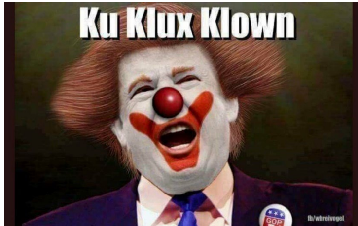
Figure 4. Metaphorical portrayal of Trump as a KU KLUX CLOWN (Live on Stage 2018)

The meme consists of Trump's Photoshopped image in a clown's makeup, the words Ku Klux Klown at the top of the picture and abbreviation GOP on the badge in the lower right corner, which stands for the Republican Party also referred to as the Grand Old Party. Taken together, these perceptual stimuli translate the TRUMP-PRESIDENT IS A KU KLUX CLOWN multimodal metaphor.