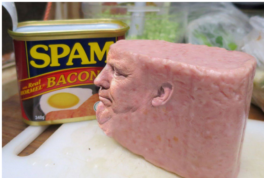
Figure 7. Metaphorical portrayal of Trump as SPAM (BRing 2019)

One more source domain engaged in metaphorical memes portraying Trump on his Twitter is that of FOOD. The instantiation given below is a reply to the president's tweet Two Fantastic People! My friends from the very beginning. Thank you D&S.