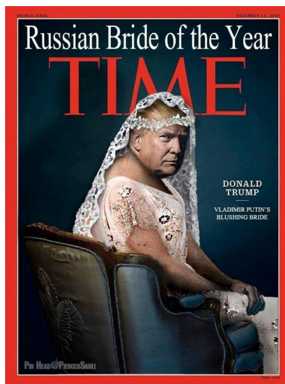
Figure 2. Metaphorical portrayal of Trump as PUTIN'S BRIDE (Lade Sade 2018)

Another example of multimodal metaphors elaborating the PERSON source domain is a reply to Trump's tweet The Russian Witch Hunt Hoax, started as the "insurance policy" long before I even got elected, is very bad for our Country. They are entrapping people for misstatements, lies or unrelated things that took place many years ago. Nothing to do with Collusion. A Democrat Scam!