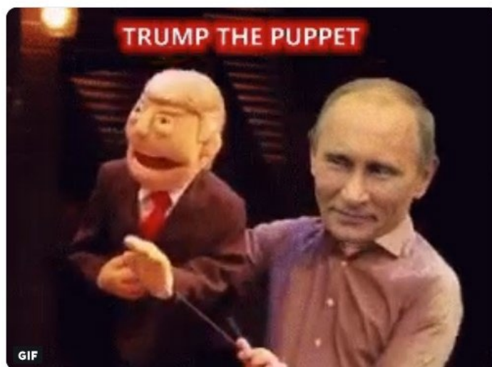
Figure 6. Metaphorical portrayal of Trump as PUTIN'S PUPPET (Chefjoeygibsonrivas 2019)

Another widespread portrayal of Trump is based on the PUPPET domain. The analysed meme is a reply to Trump's tweet While my (our) poll numbers are good, with the Economy being the best ever, if it weren't for the Rigged Russian Witch Hunt, they would be 25 points higher! Highly conflicted Bob Mueller & the 17 Angry Democrats are using this Phony issue to hurt us in the Midterms. No Collusion!