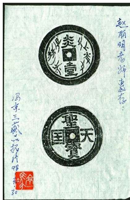
Figure 2. The sketch of the coin from the Taiping Rebellion / the Taiping Civil War. Available at: http://history.people.com.cn/BIG5/n1/2017/0904/c372329-29513805.html