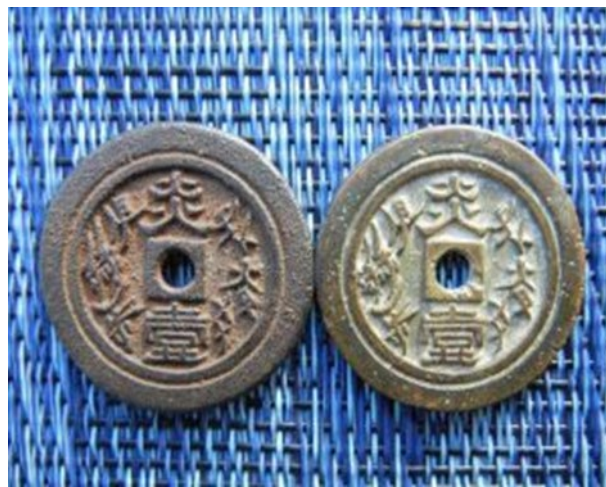
Figure 1. The coin from the Taiping Rebellion / the Taiping Civil War.

created between women, especially at a young age (Liu 2015). Hence, the expression 天下妇女，姐妹一家 (tiān xià fù nǚ, jiě mèi yī jiā), which comes from 女书 (nǚ shū), refers to sisterhood and means "women in the world are like sisters in the family" (Liu 2004: 253). The words are an inscription on a coin, which is considered as the oldest known artefact with text in 女书 (nǚ shū), the coin (Figures 1 and 2 below) is known as an 'engraved mother coin' – 雕母钱 (diāo mǔ qián), which proves the script was in use in the 19 th century.